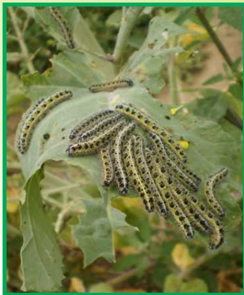
Plate 5: Cabbage Caterpillar