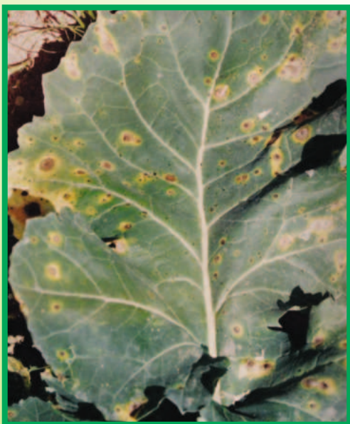
Plate 6: Alternaria Blight