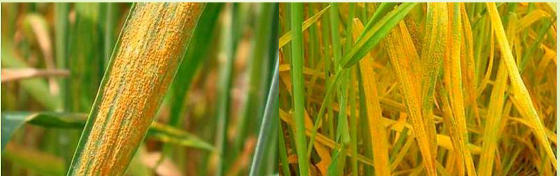
Plate 3 : Yellow rust attack