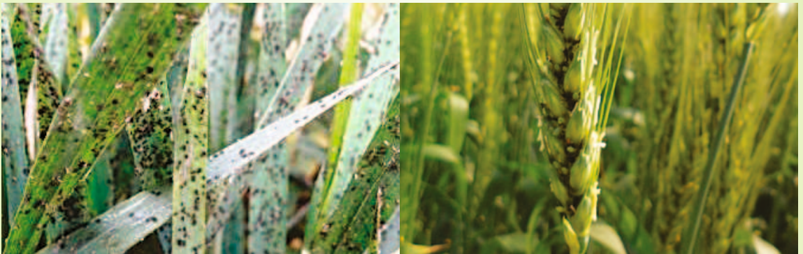
Plate 2 : Aphid attack