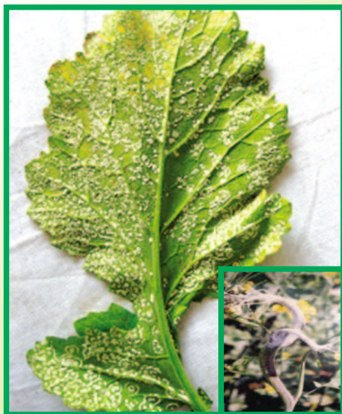
Plate 7: White Rust