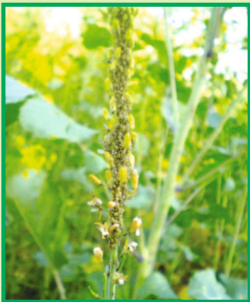
Plate 4: Mustard Aphid