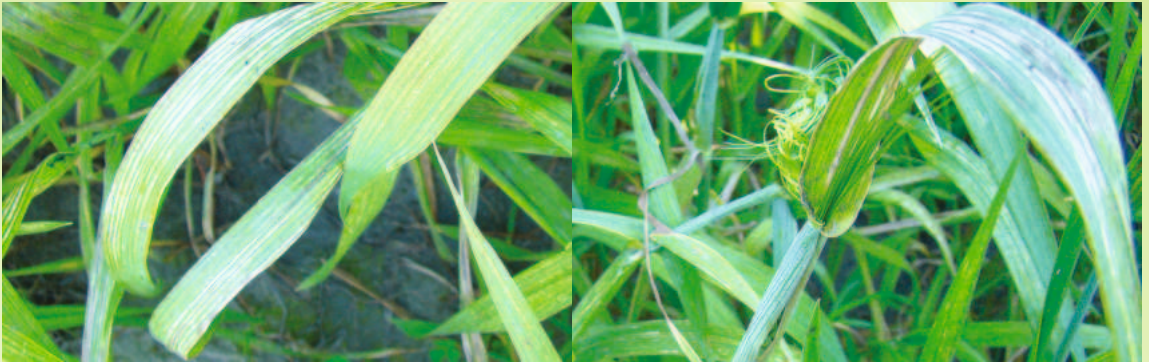
Plate 1 : Manganese deficiency